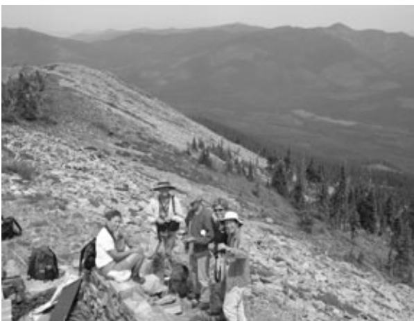
On top of Mt. Henry with clear cuts in the background

areas. The Forest Service is required to limit roads above 4500-foot elevation in order to protect grizzly bear habitat. The local Kootenai National Forest is working on its revision of Forest Plan and we were there to help the local environmentalists make a case for wilderness and bring some publicity to this wild and remote area. At the end of our time there we did meet with the Kootenai District Ranger and some of his staff. We also made the front page of the Sunday Missoulian, the major state newspaper for Montana. An added bonus was the opportunity to meet and hang out with the locals, including nature writer, Rick Bass.