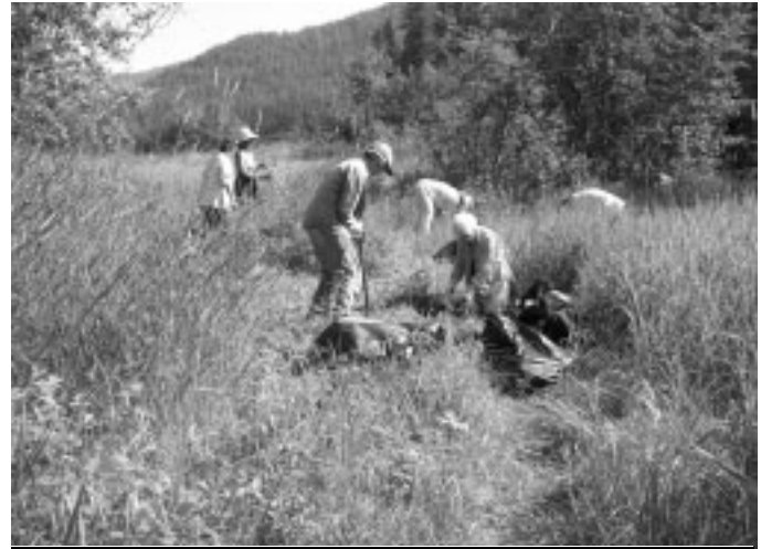
Pulling noxious weeds

clear cuts from the past 5 decades. Another day we worked on pulling noxious weeds near Hoskins Lake. The local environmental group, The Yaak Valley Forest Council, is trying to protect 14 roadless areas still remaining in the Yaak Valley. The presence of grizzly bears is one of the major reasons for the continued existence of the roadless