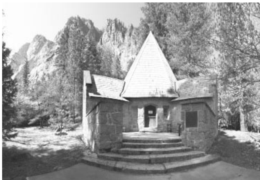
LeConte Memorial Lodge