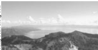
Relay Peak along TRT

See the Tahoe Rim Trail as we bring it to you! The Tahoe Rim Trail Association is a non-profit organization dedicated to planning, building and maintaining a 165-mile loop trail along the ridge tops of beautiful Lake Tahoe. Join the TRTA staff in a virtual tour of the Association and the Trail. We'll take an in-depth look into the operations of a successful non-profit run by a small paid staff and supported by thousands of volunteer hours. And we'll discuss ways to both segment-hike and thru-hike the entire loop trail.