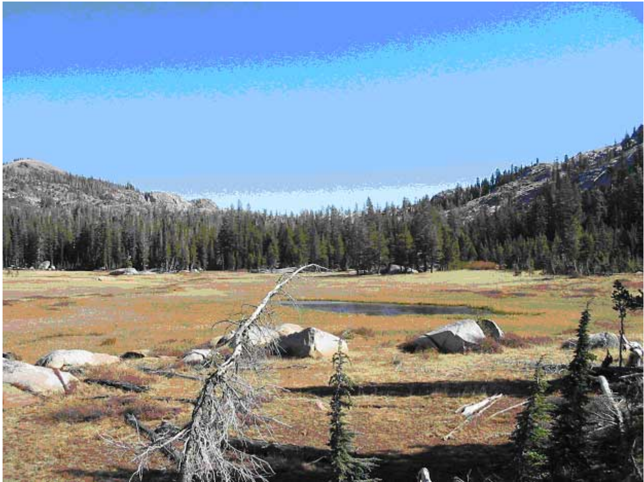
Granite boulders and small pond in Paradise Valley Paradise Lake is in the saddle, center horizon.

Although most of Donner Summit is covered with old lava flows, the lava has been eroded from Paradise Valley. Both the valley and the lake are framed beautifully by the white granite.