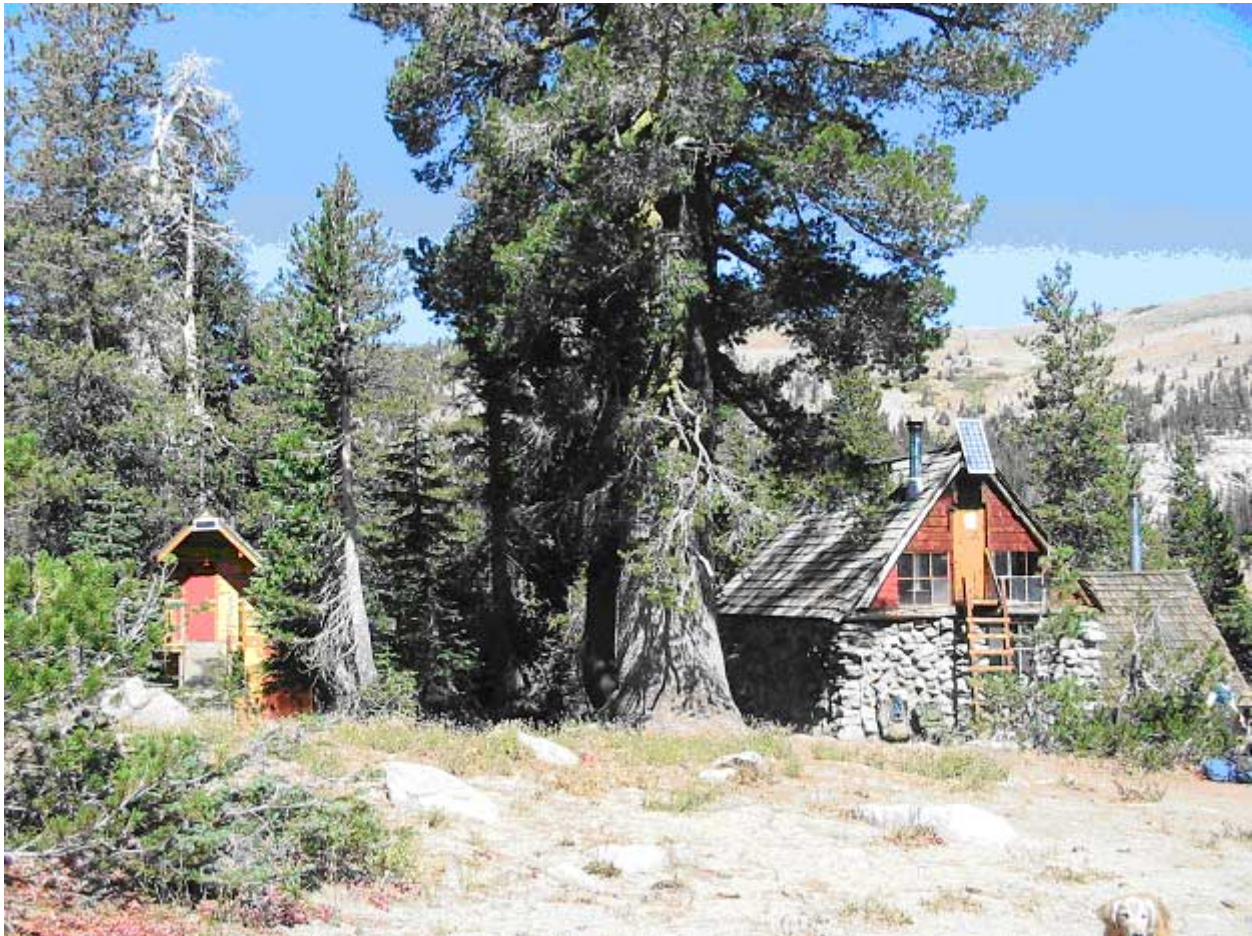
Peter Grubb Hut provides winter shelter to backcountry skiers and snowshoers

From the pavement end, follow the dirt road about ¼ mile to the south end of Castle Valley. Bear left and up, keeping Castle Valley on your right. At about a mile from the end of pavement the road forks; take the left, upward branch. About ½ mile farther, you will see signs for the Hole-in-the-Ground (mountain biking) Trail on the left; there is parking here. The road gets worse, first with potholes at a spring, then in several sections where there are huge ruts and protruding rocks. The road ends at the base of Castle Pass.