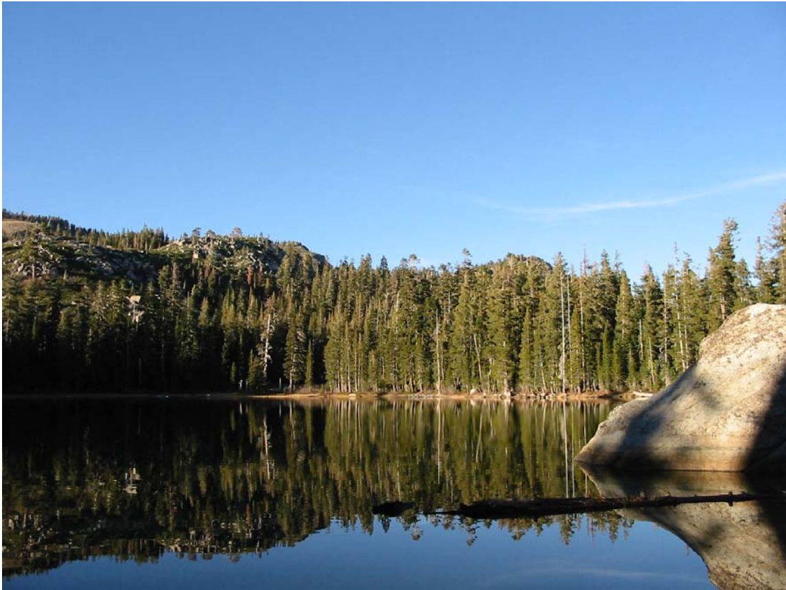
Summit Lake from the south (IMG_2122.JPG).

in nearly all directions. The jagged peaks through the gap to the northwest are Sierra Buttes. You can barely see Lake Tahoe through a gap in the ridge just north of Tahoe City. Some of the peaks beyond may be visible on a clear day (perhaps 100 miles away).