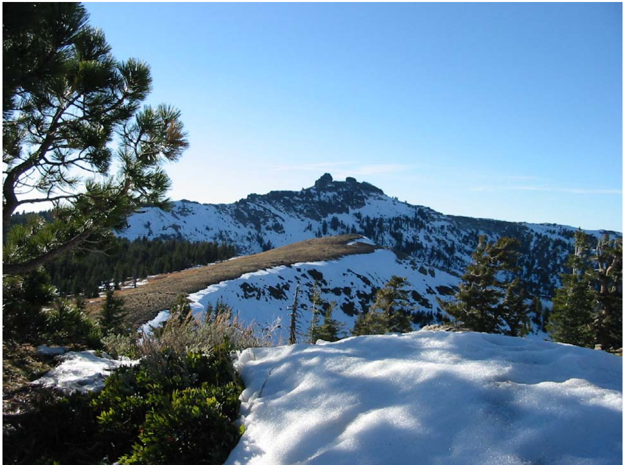
Castle Peak from Frog Lake Overlook in late November (IMG_2118.JPG).

Take the Boreal/Castle Peak exit from I-80 at Donner Summit. Go east along the frontage road on the south side of the freeway, pass the Boreal Motel, and park in the PCT trailhead area at the end of the road.