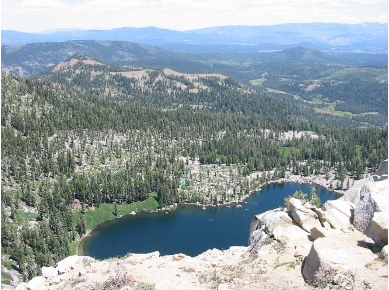
Frog Lake from its overlook (IMG_5425.JPG)